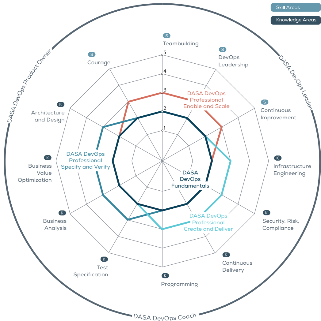
1. Novice / 2. Competent / 3. Proficient / 4. Expert / 5. Master

The DevOps Agile Skills Association (DASA) competence framework identifies 8 knowledge areas and 4 skills that are relevant in DevOps, as shown in the following figure.